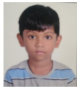
Chakradhar-II 1st Position (Hin)