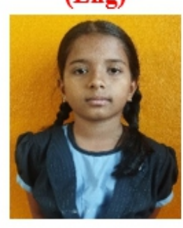
Rishika-III 2<sup>nd</sup> Position (Eng)