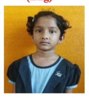
Inaya-III 1<sup>st</sup> Position (Hin)