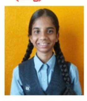
Jannath-VII 1<sup>st</sup> Position (Hin)