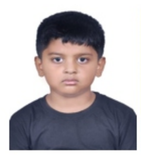
Tarutra-I 1<sup>st</sup> Position (Eng)