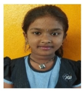
Dhrithi-II 2<sup>nd</sup> Position (Hin)