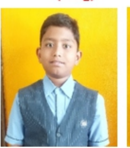
Armaan-V 1st Position (Hin)