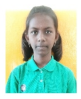
Skandavi-VI 1<sup>st</sup> Position (Tel)