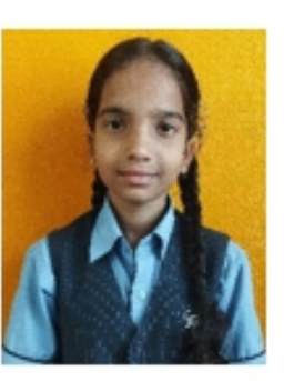
Rehemathi-VI 1st Position (Hin)