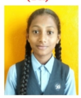
Maheshwari-VII 1<sup>st</sup> Position (Tel)