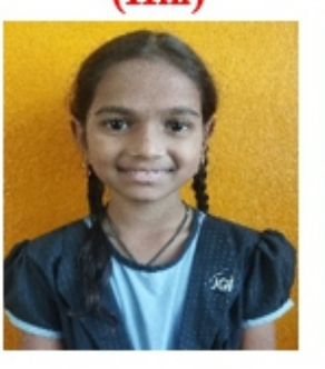
Ujwala-IV 1st Position (Eng)